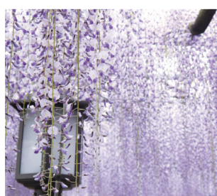
Kurogi Grand Wisteria