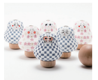
[Nationally Designated Traditional Craft] Yame Lanterns

There are many other things to see. For more information, click here. ▶