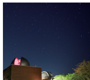
Night sky in Hoshino Village