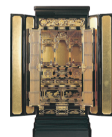
[Nationally Designated Traditional Craft] Yame Fukushima Buddhist Altars

Yame has a long, rich history of traditional crafts. The refined skills of Yame artisans are still alive in the old streets of the town.