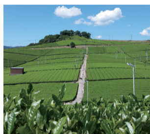
Yame Central Tea Plantation

The flowers blooming in Yame, land of tea, are all idyllic and lovely. You will be welcomed by spectacular views of mountain foothills, along with seasonal flowers and natural landscapes.