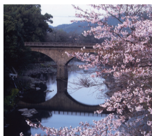
Yoriguchi Bridge (spectacles bridge)